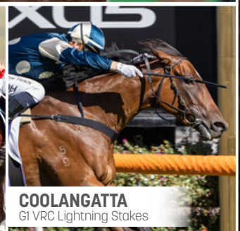
COOLANGATTA G1 VRC Lightning Stakes