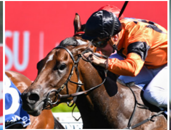
SUNSHINE IN PARIS G1 ATC Surround Stakes