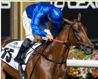
IN SECRET G1 VRC Newmarket Handicap