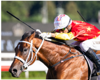
MILITARIZE G1 ATC Champagne Stakes