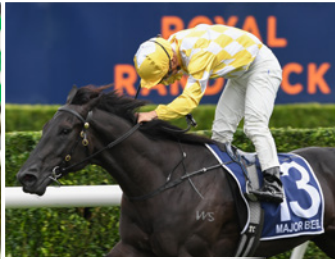
MAJOR BEEL G1 ATC Australian Derby