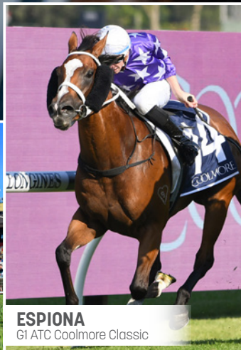
ESPIONA G1 ATC Coolmore Classic