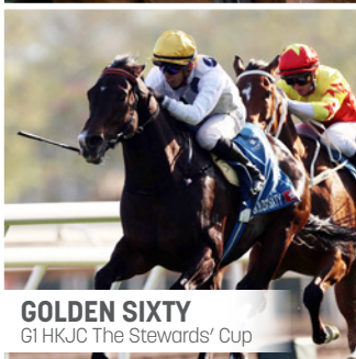
GOLDEN SIXTY G1 HKJC The Stewards' Cup