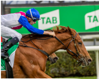
ROYAL MERCHANT G1 SAJC The Goodwood