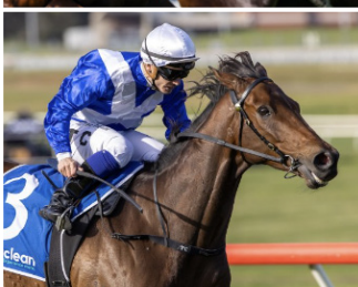
ALLGATOR BLOOD G1 MRC Underwood Stakes