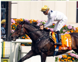
GOLDEN SIXTY G1 HKJC Champions Mile