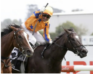
IMPERATRIZ G1 Waikato RC Sprint