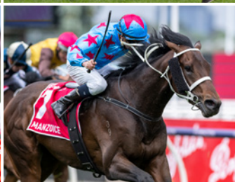
MANZOICE G1 VRC Victoria Derby