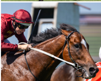
JACQUINOT G1 MRC CF ORR Stakes