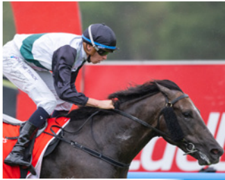
LITTLE BROSE G1 MRC Blue Diamond Stakes