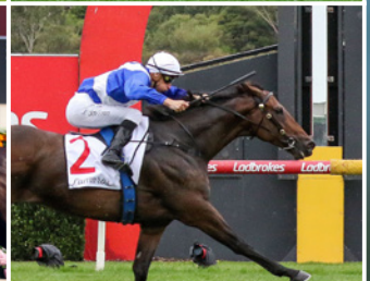
ALLGATOR BLOOD G1 VRC Futurity Stakes