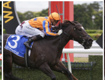
IMPERATRIZ G1 Waikato RC Railway Stakes