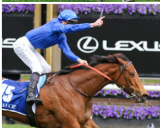
IN SECRET G1 VRC Coolmore Stud Stakes