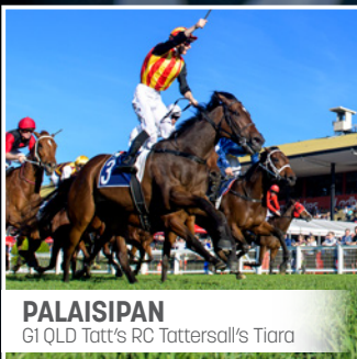
PALAISIPAN G1 QLD Tatt's RC Tattersall's Tiara