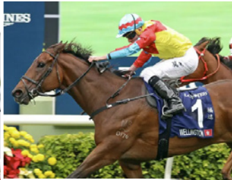
WELLINGTON G1 HKJC Hong Kong Sprint G1