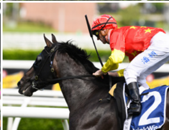
ARTORIUS G1 ATC Canterbury Stakes