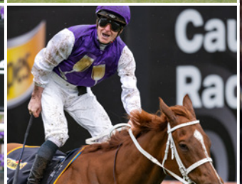
MADAME POMMEROY G1 MRC Thousand Guineas