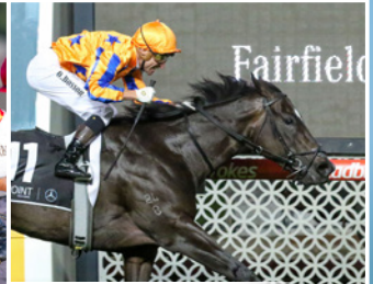
IMPERATRIZ G1 MVRC William Reid Stakes