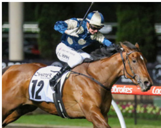
COOLANGATTA G1 MVRC AJ Moir Stakes