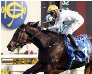
GOLDEN SIXTY G1 HKJC Hong Kong Gold Cup