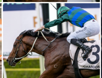
JACQUINOT G1 ATC Golden Rose Stakes