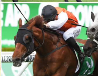
ELLSBERG G1 ATC Epsom Handicap