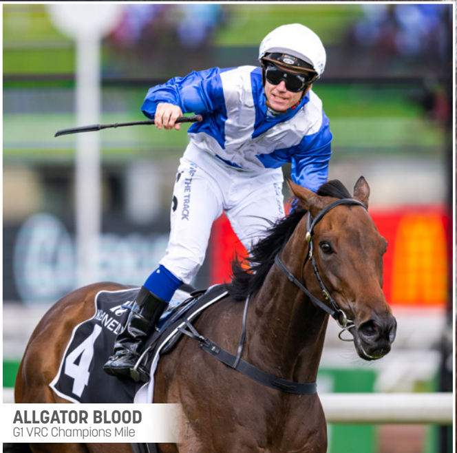
ALLGATOR BLOOD G1 VRC Champions Mile

Magic Millions is the undisputed number one source for the most Group One winners, Group One wins, Stakes winners and Stakes wins - delivering the results buyers want again. Expose your yearlings where the buyers shop for their champions.