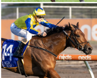
SNAPDANCER G1 MRC Memsie Stakes