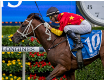
MILITARIZE G1 ATC Sires' Produce Stakes